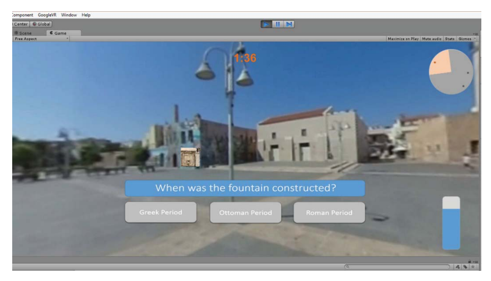
Fig. 4. Gameplay snapshot.

A snapshot of the gameplay is shown at Fig. 4 depicting the main UI elements, the radar map, and the water level indicator that depicts the points gained, the time limit and the play/pause button.